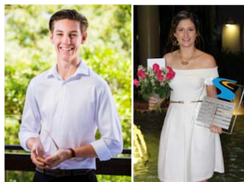
Students with their awards.

While we celebrate these successes, we are most proud of the young men and women our students have become. These are qualities that cannot be measured or reported but they are most important. These are qualities that are regularly commented on by those outside the community as they interact with our students.