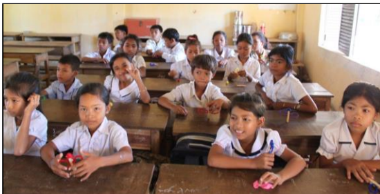
Students at Kampong Chhnang Primary School