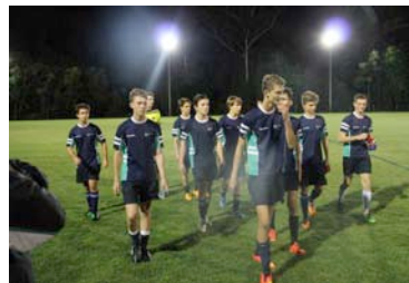
season for 2015.

This week, the open boys football team played in the grand final of the SCISSA competition at Matthew Flinders Anglican College, marking the end of the SCISSA football