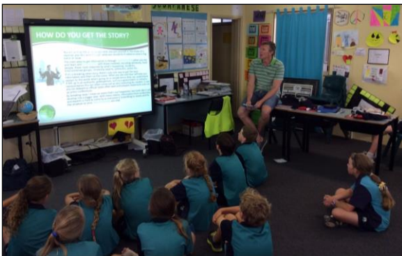
Year 5 Students